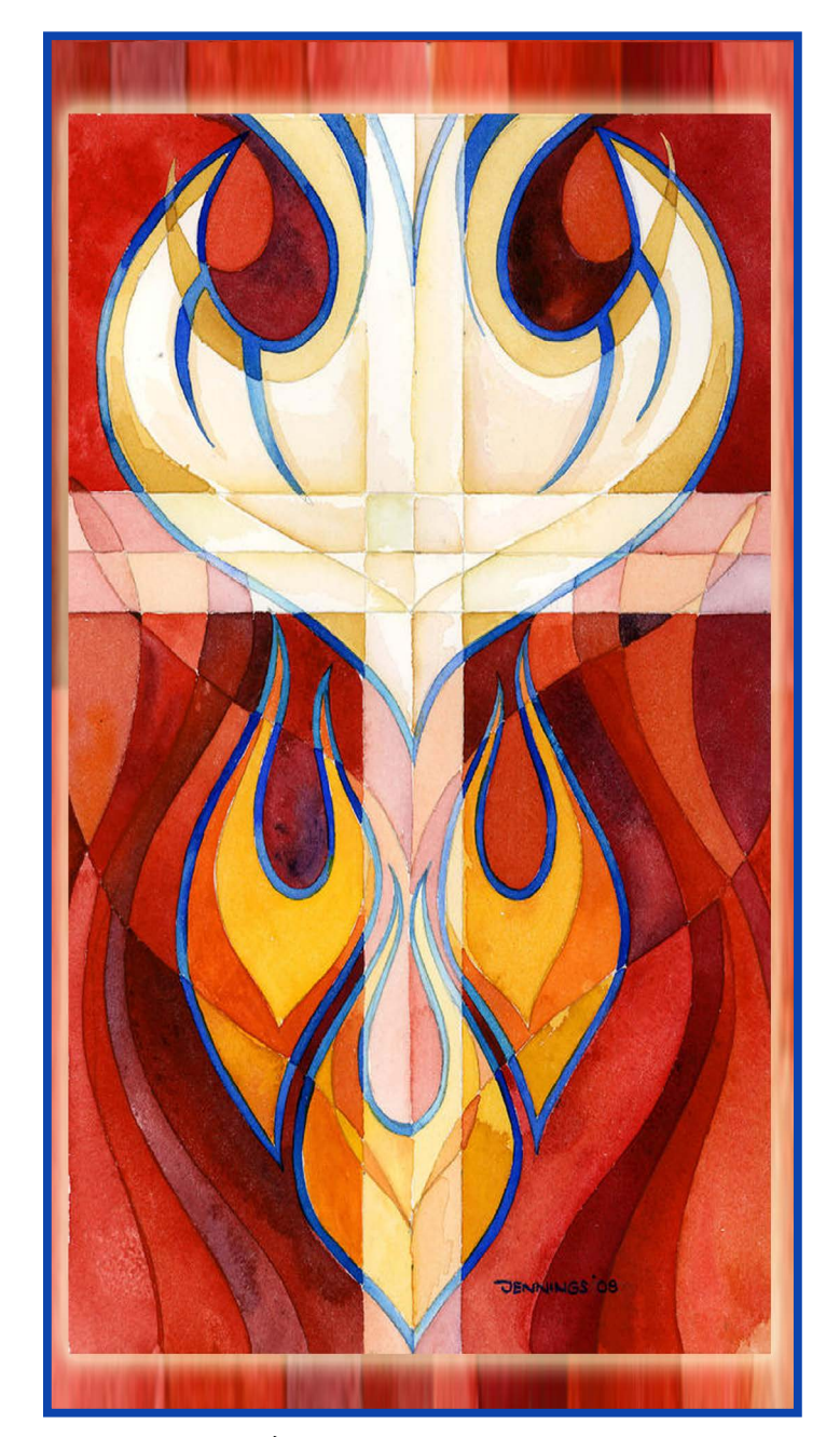
For we are GOD'S WORKMANSHIP, created in CHRIST JESUS to do good works, which GOD prepared in advance for us to do.